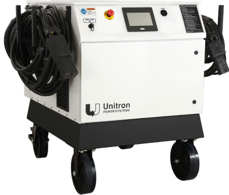
MOBILE CONFIGURATION (Shown with standard touch screen panel)